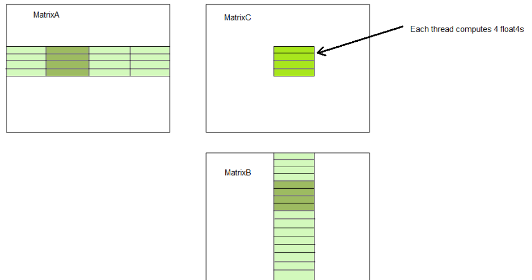
Figure 1 Matrix Multiplication on the Radeon HD™ 4XXX Series GPUs