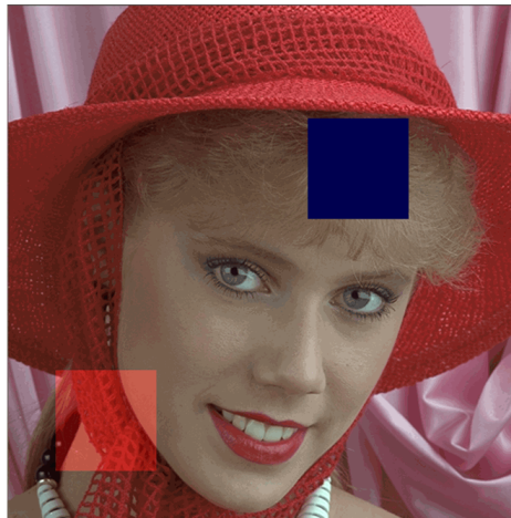
Figure 2 Resulting Overlapped Images

Figure 2 shows the result of the overlapping of the two images in Figure 1.